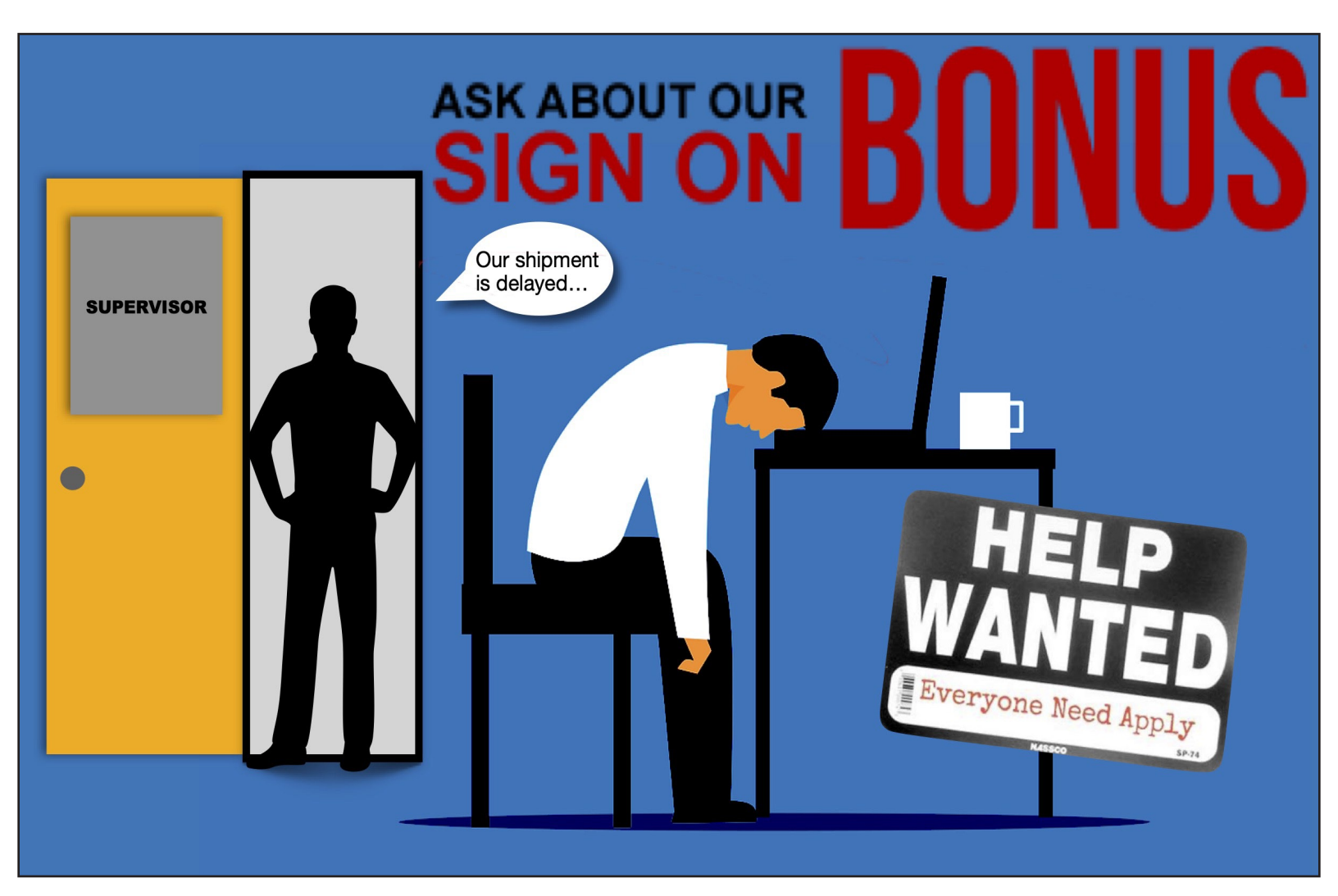
Delays in shipping attributed to complications in logistics because of Covid have put a strain on manufacturers, consumers, and business owners alike.

or almost two years, we have been battling with covid issues and its affect on business. While the personal losses are much greater, than anyone could ever express, the business issues and complications as a result of the virus impact everyone, as well.